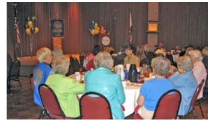
Many members and guests attended the March 20th luncheon honoring our Making a Difference for Women and our Women's Opportunity Award winners