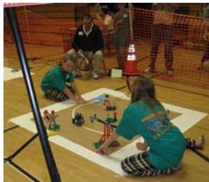
Only two members can participate at a time. In "Freeform" the robot must follow the line and stop before the finish line.