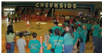
The gymnasium floor at Creekside Elementary was divided into several "challenge" event areas, as participants in green T-shirts gathered waiting for the games to begin.