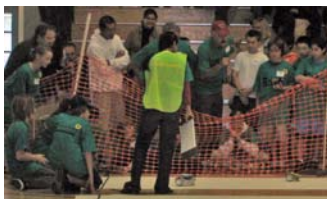
The team made it all the way to the final "Drag Race" for 2nd place That was further than they had ever been ! Girls Rock!