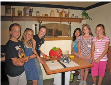
On April 17th, members of the 4th to 6th grade "Girls Rock!" team showed some of their projects made with a Lego Robotics kit donated by the club. The team will be entering three events at the Sonoma County Robotic Challenge .