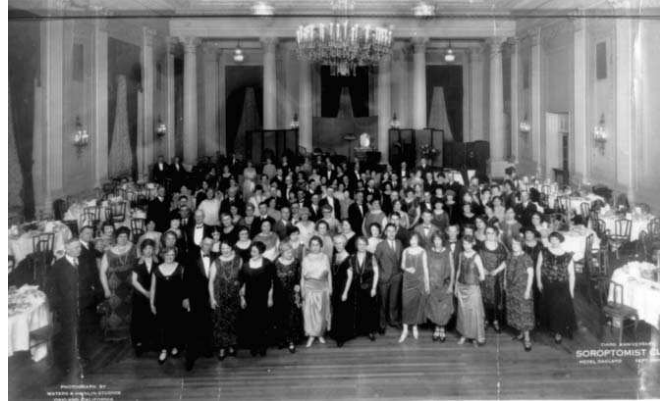
Photo above shows members of the first Soroptimist club, SI of Alameda County, with their guests celebrating the club's 3rd Anniversary in 1924.

Soroptimists around the world celebrate Founders Day on October 3, which acknowledges the day in 1921 when the first Soroptimist club in Alameda County, California, called to order its first business meeting.