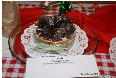
How about a Tiramisu cake?

Everyone had a great time at our club fundraiser February 26th at the Scottish Rites Center