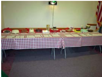
13 Desserts to choose from