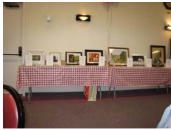
Many Items to see at the Dessert, Raffle, Silent and Live Auction Tables