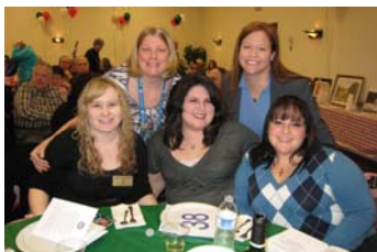
And wonderful people who bid and youth who helped serve our food and our guests!