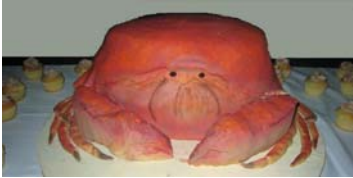
Truly a "Crab Cake"

Soroptimist International helped sponsor "next year's" Kids Spree event organized by the Active 20-30 club with a $3000 donation.