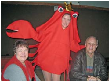
Meeting the "Crab Queen"